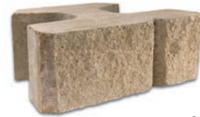
Straight Split 6/12