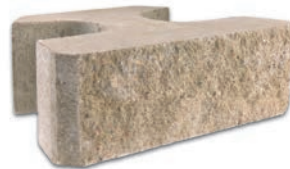
Straight Split 18